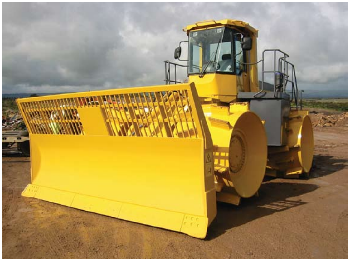
SRWRA took delivery of this new landfill compactor during 2007–08.

In a bid to assist with the control of on site litter, a permanent litter fence and several moveable litter fences have been installed on the south eastern portion of the site adjacent to Cell 2.